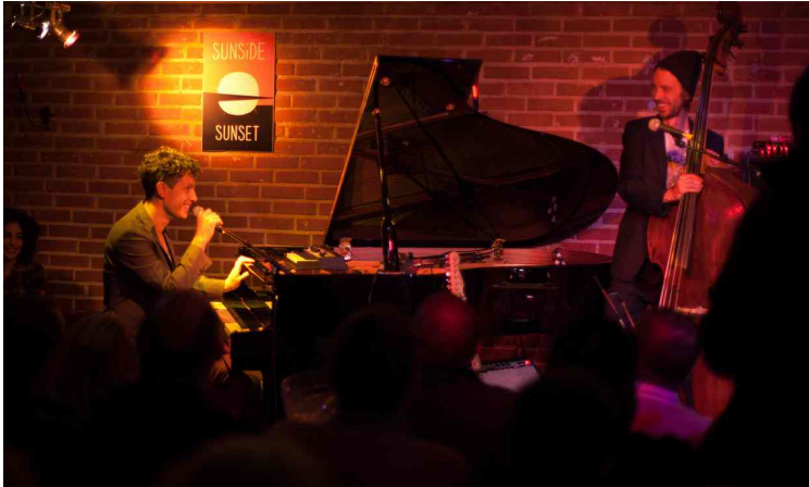
Le Sunset Sunside / Paris 01 / 11-12-2012

A club I really enjoy both playing at and visiting is Sunset/Sunside, one of three jazz clubs on Rue des Lombards. It's a spirited little place with a real jazz club ambience: Sunside is on the ground floor, and Sunset is a cavernous space in the basement. You can see all the great names in jazz here, as well as new talent in other genres. It attracts an eclectic crowd, many of whom often go out of curiosity, not knowing in advance who'll be performing.