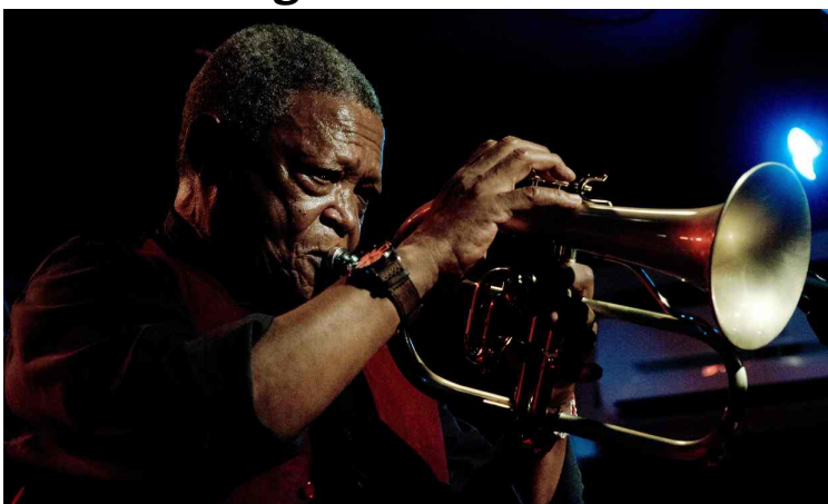
South African jazz musician Hugh Masakela at the New Morning club.

It's easy to fall in love with the distinctive mood and exotic atmosphere at New Morning. It opened back in 1981 and many jazz icons played there towards the end of their careers: Chet Baker, Dizzy Gillespie, Stan Getz, Dexter Gordon and so on. Prince named it his